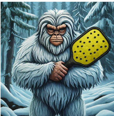
Yeti Division Division

We just started our third season last month. We now have a total of 29 teams across 3 divisions. Games are now played on Wednesday and Thursday nights at 6:30 and 7:30 PM. Our 3 divisions are separated based on skill levels. Our Yeti Division is basically beginners or those that are new to the sport. Our Skunk Ape Division is more of an intermediate level of play. Our Bigfoot Division is our most competitive division as we have developed and drawn some better players to our league.