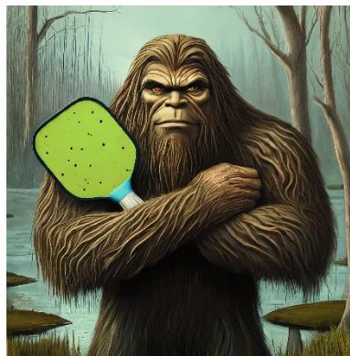
Skunk Ape Division