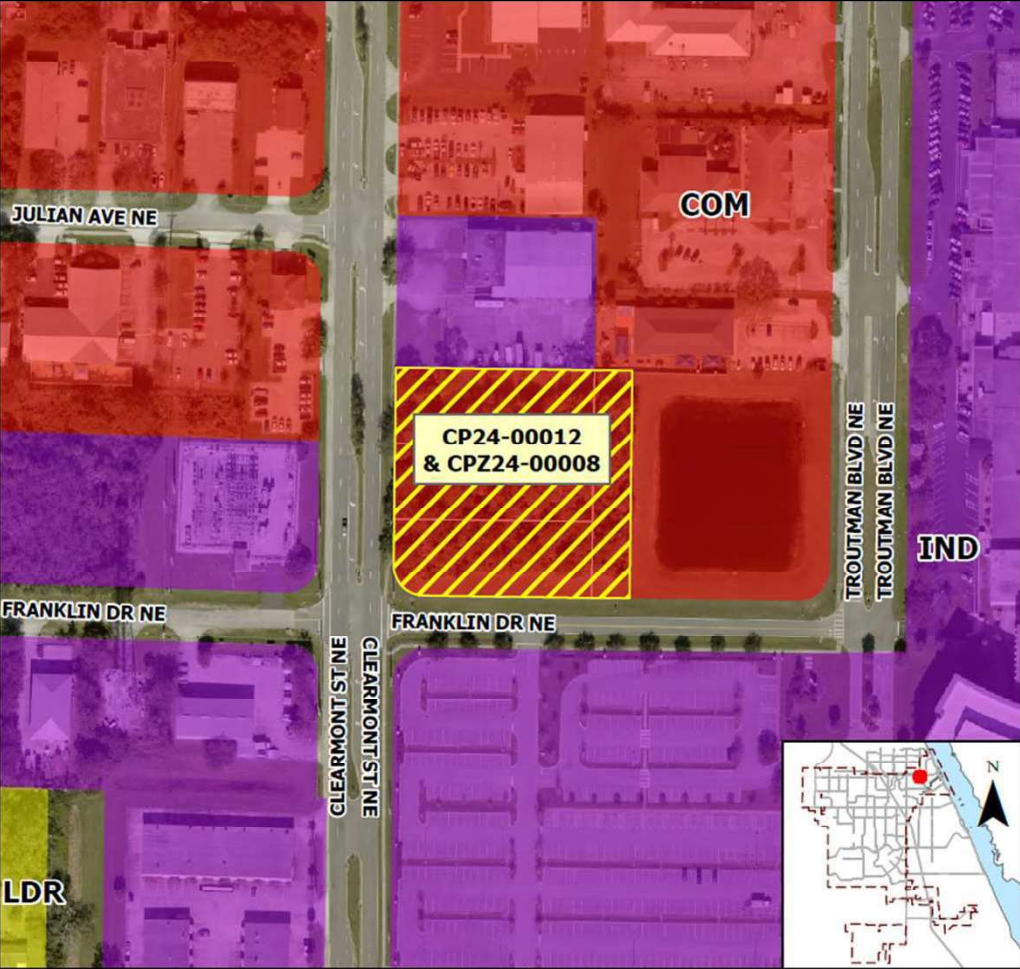
FUTURE LAND USE MAP