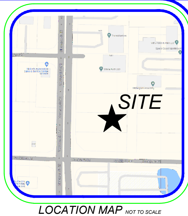
LOCATION MAP NOT TO SCALE