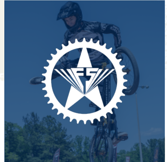
USA BMX FREESTYLE