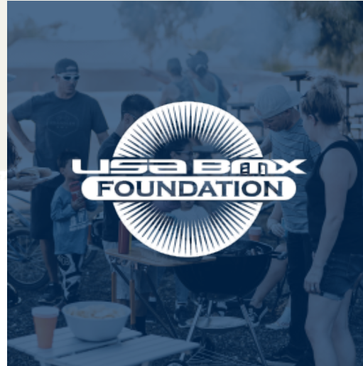
USA BMX FOUNDATION