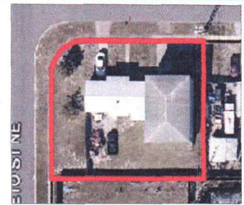
AERIAL PHOTOGRAPH (MAY NOT SHOW LATEST IMPROVEMENTS) (NOT-TO-SCALE)